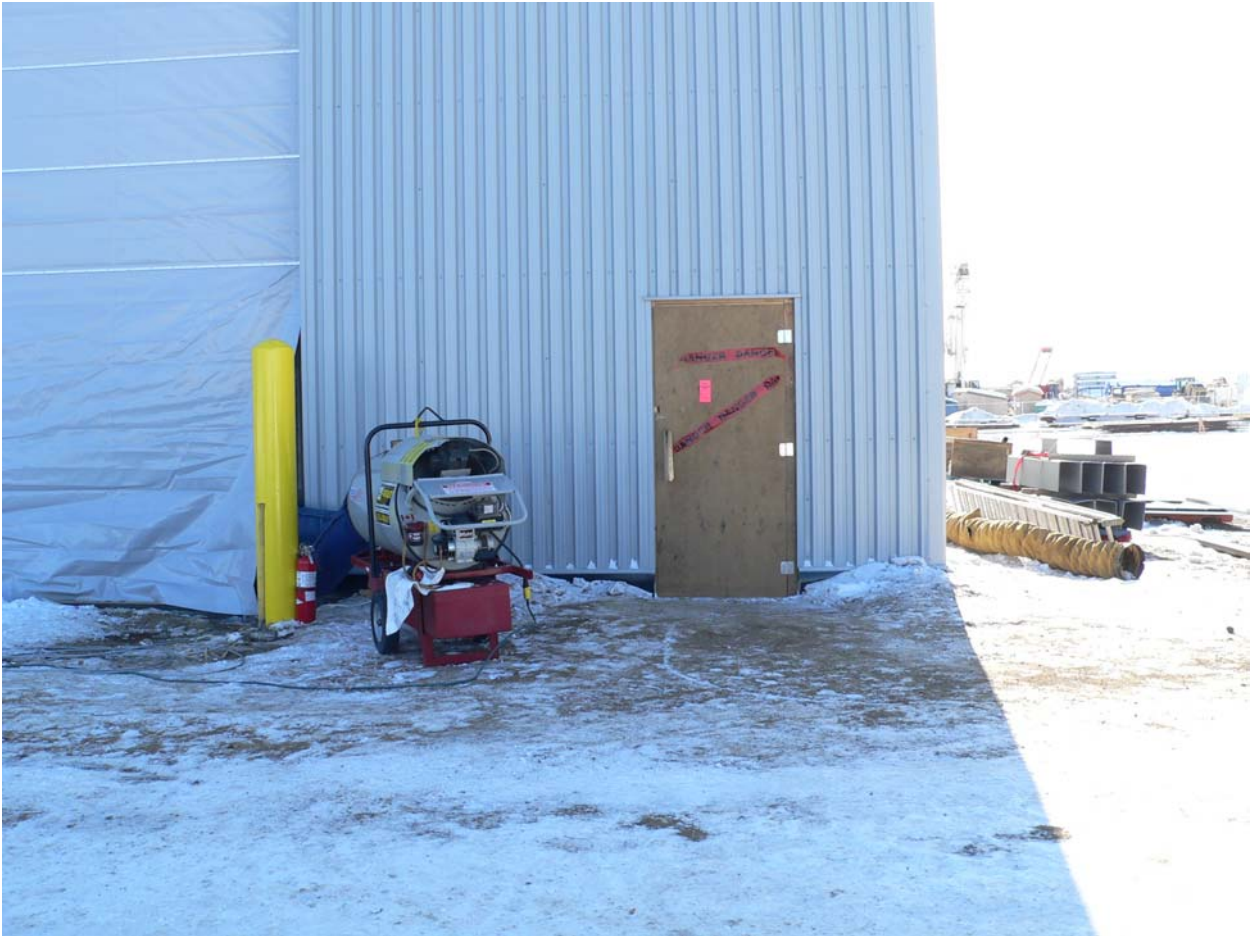
Photograph #1 Shows the man door where the Worker entered the building under construction.