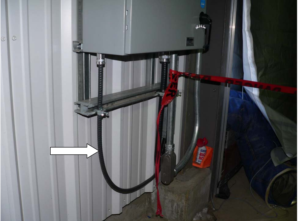
Photograph #3 Shows the type of black electrical tech cable attached here to the electrical panel that was on the floor near the doorway at the time of the incident.