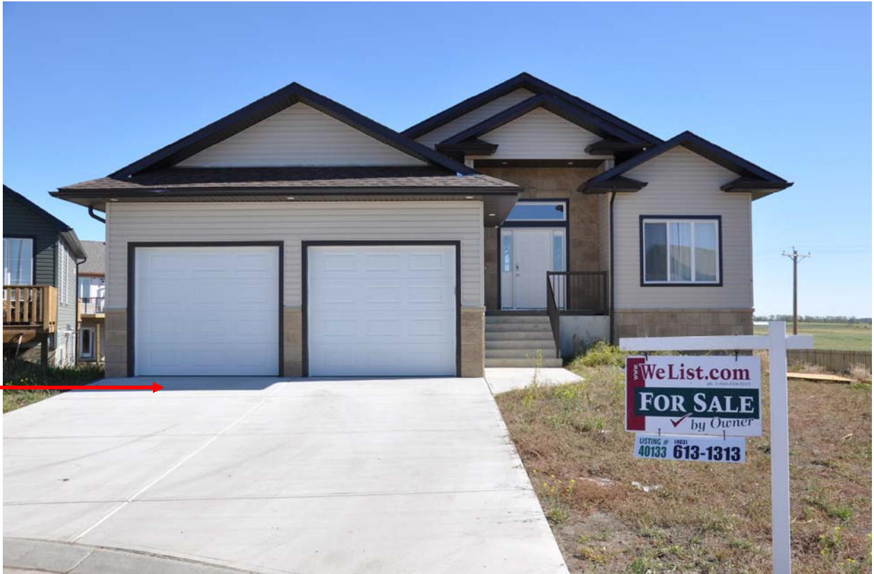
Photograph 1: Front view of the house where the incident occurred

Arrow shows the location where the owner landed after he fell