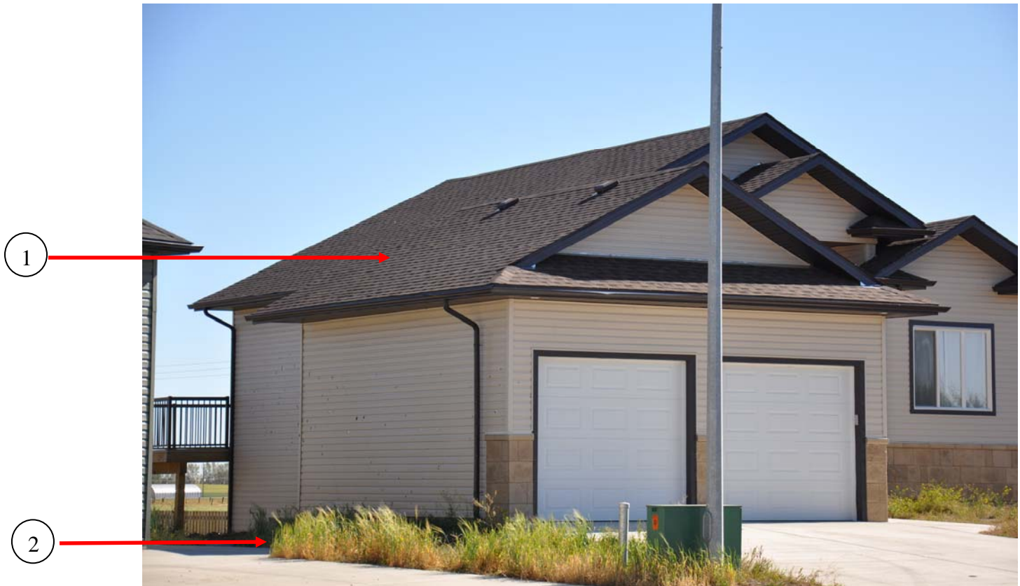
Photograph 2: This photograph was taken after the roofing job was completed